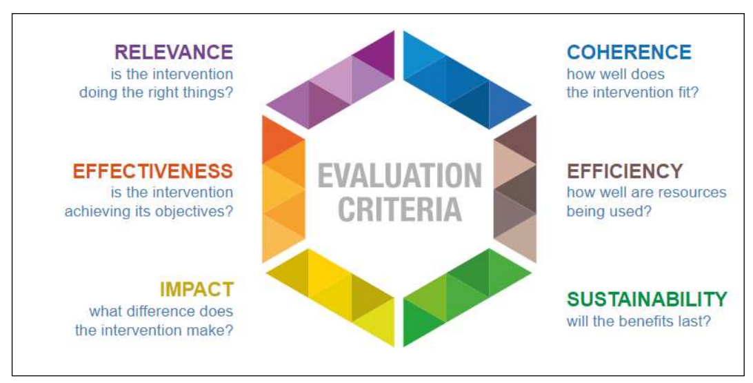
Figure 1: OECD-DAC Framework

The OECD DAC Network has identified six evaluation criteria and two principles for their application: relevance, coherence, effectiveness, efficiency, impact, and sustainability. These criteria are meant to help facilitate evaluations. They were revised in 2019 to improve the accuracy and utility of assessment and to strengthen the evaluation's contribution to sustainable development (OECD, 2020).