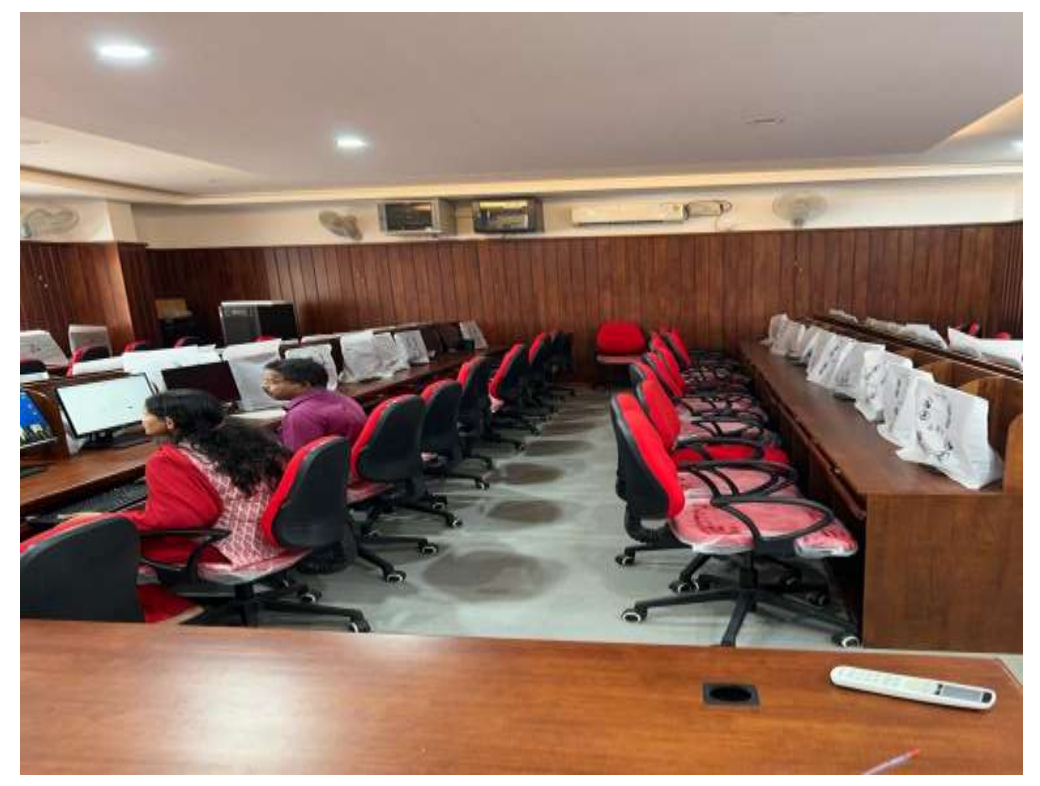
Figure 6: Computer lab by GAIL