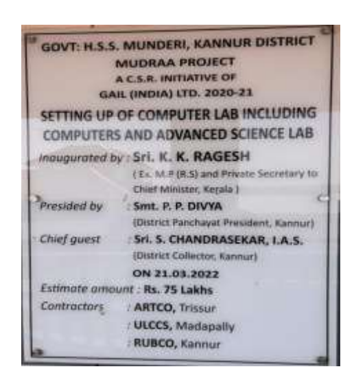
Figure 3: GAIL's branding at the school