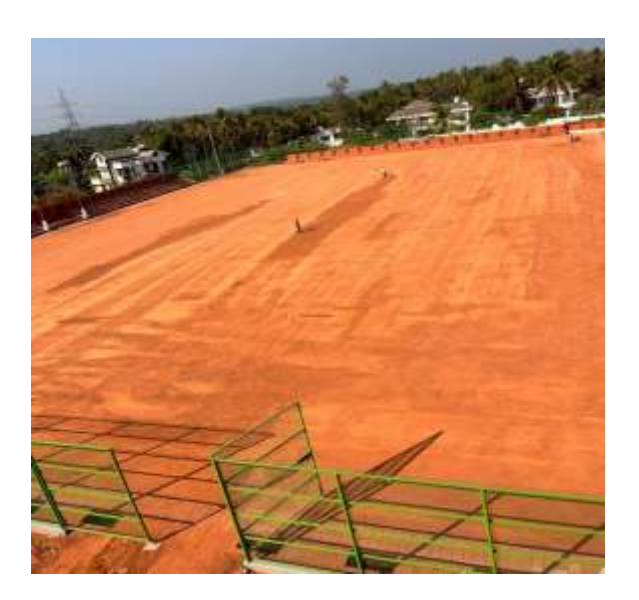
Figure 4: Playground in the school renovated by GAIL

facilities. School infrastructure is, therefore, an essential component in ensuring successful education.<sup>23</sup>